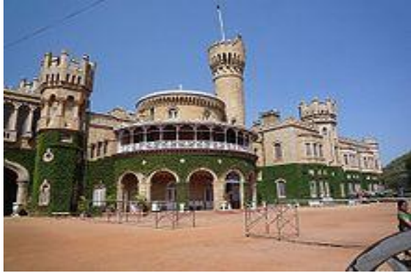
Bangalore Palace – 6.1 kms