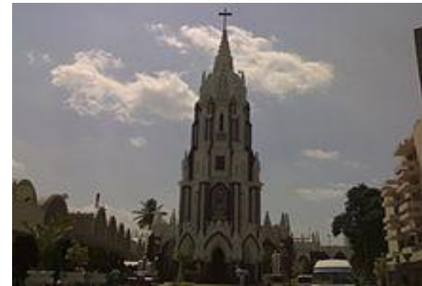
St. Mary's Basilica – 7.8 kms