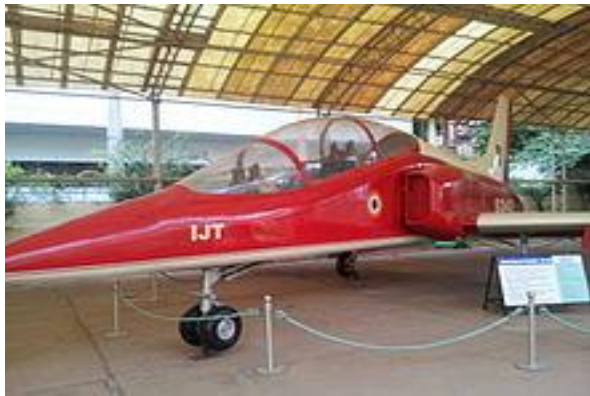
HAL Aerospace Museum – 15.2 kms