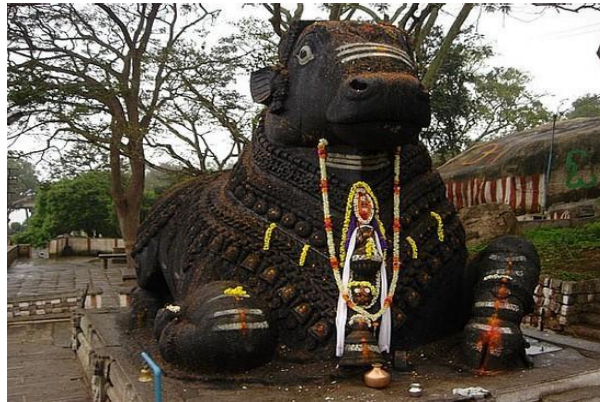
Bull Temple – 14.4 kms