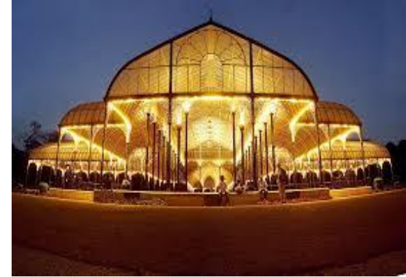
Lal Bagh – 7.5 kms