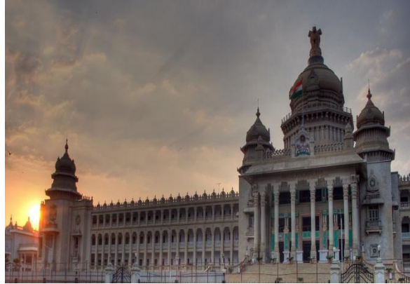
Vidhan Soudha – 7 kms