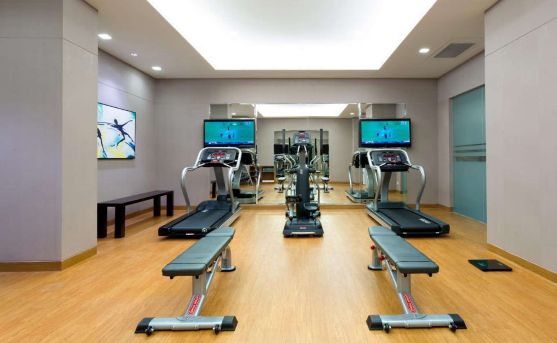
Fitness Centre Level 1